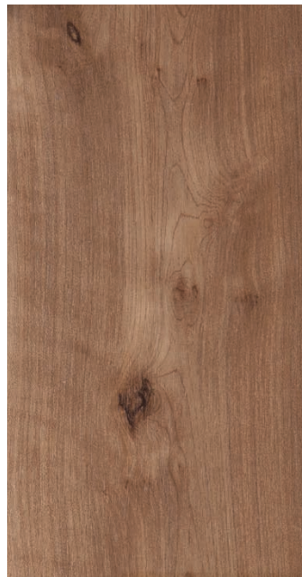
DESERT SPOTTED GUM