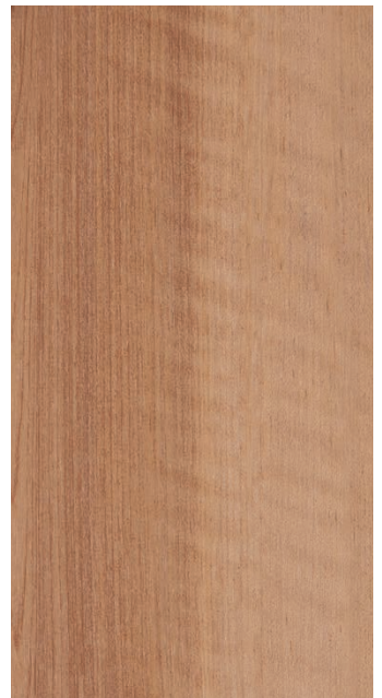
OUTBACK SPOTTED GUM

*Coastal Blackbutt has multi shade planks in every box to create a natural variation of design