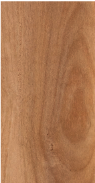
COASTAL BLACKBUTT Multi Shade Planks