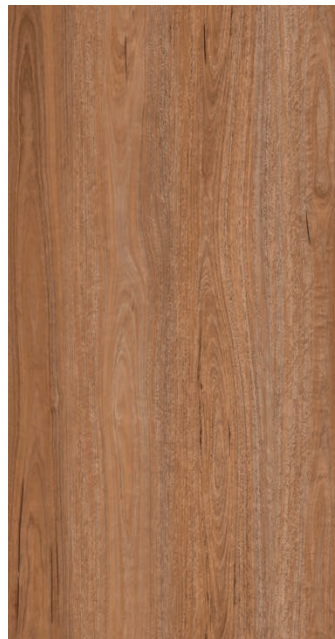
COASTAL SPOTTED GUM