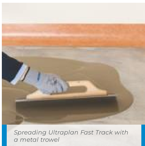
Spreading Ultraplan Fast Track with a metal trowel