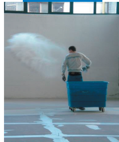
Throwing Quartz 0.9 AU into wet Mapeproof 1K Turbo

All relevant references for the product are available upon request and from www.mapei.com.au