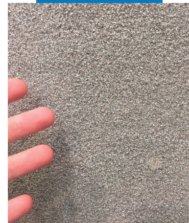
All loose sand removed and final surface completely saturated