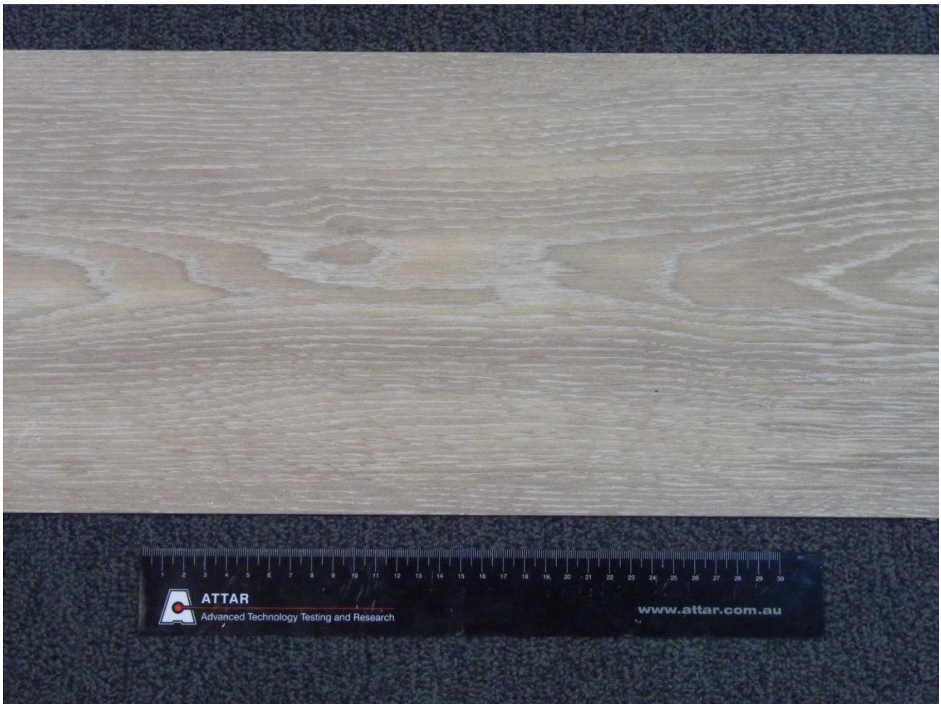
Figure 1. WP411-Dr Schutz PU Anti Slip Coating